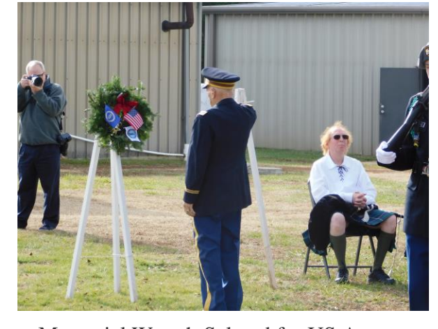
Memorial Wreath Saluted for US Army