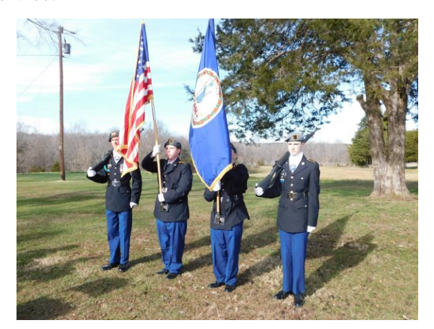
Cumberland Co. JROTC Color Guard

Our Camp was a sponsor of this event which took place on Saturday December 16<sup>th</sup> at noon, at Trinity Memorial Cemetery located in Rice, Virginia. I attended the ceremony and was impressed and proud that our camp was a sponsor. It was a moving ceremony, with short speeches and each branch of the armed forces honored and remembered. The ceremony ended with the playing of taps from a distant location which was a nice touch. I thanked several veterans for their service entering and exiting the ceremony. After the ceremony, volunteers placed wreaths on each veteran's grave, speaking their name and thanking/saluting them for their service.