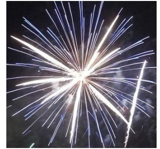
HAPPY NEW YEAR!!!!!!!!!!!!