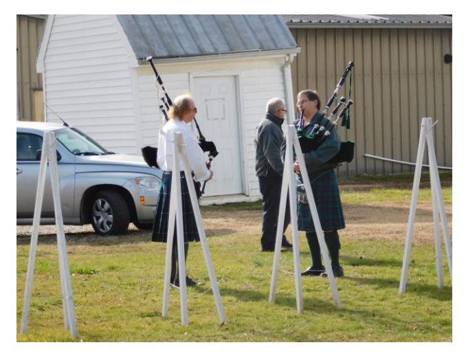
Bagpipers Play Amazing Grace